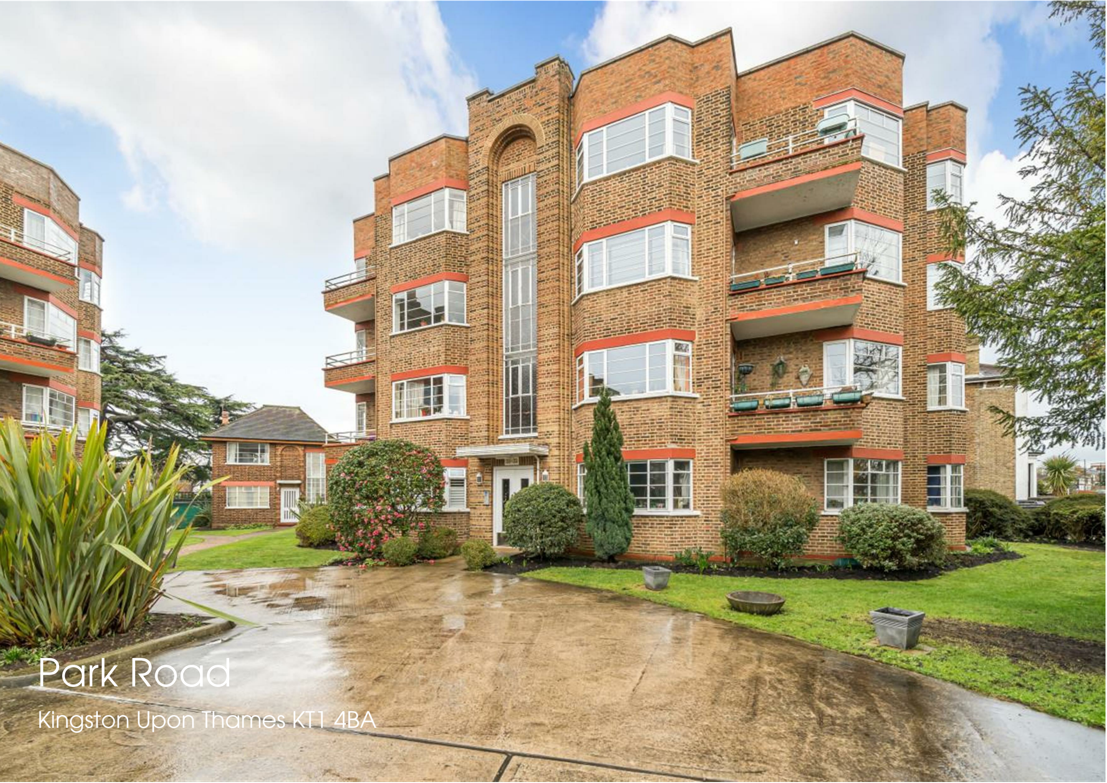
Park Road Kingston Upon Thames KT1 4BA